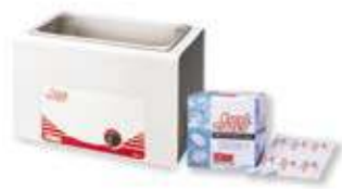
Clean&Simple™ Ultrasonic Cleaners and Tablets

Documents: date, time, temperature, pressure.