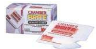
Chamber Brite Autoclave Cleaner