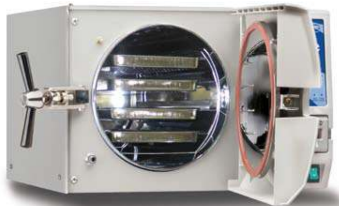
EZ10 with 4 large trays

* Above photo shown with optional printer